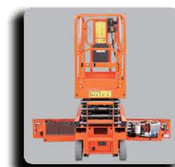
Swing Out Tray