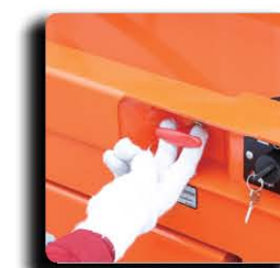
Emergency Lowering System