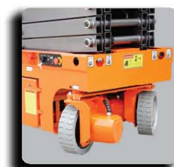
Compact Turning Radius