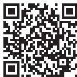
Atlas Copco RTEX