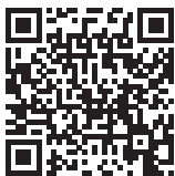
RTEX breaker comparison

Download a QR reader and scan the codes to watch the videos.