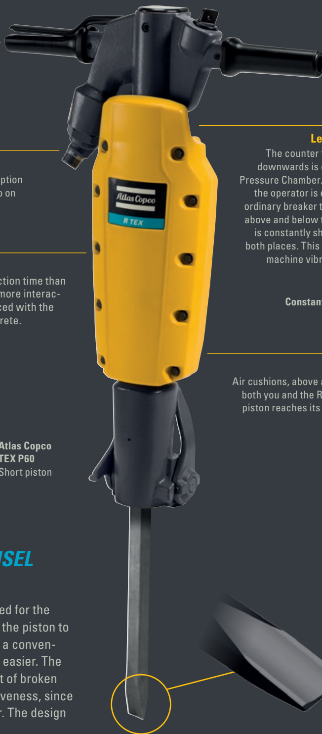
Atlas Copco TEX P60 Short piston