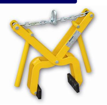
Product Code: PZC-M-500.GRAB

Flexible Grab, with the option to lift with either 2 people manually or from a hoist.