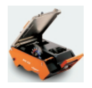
Excellent accessibility for changing blade and for cleaning.