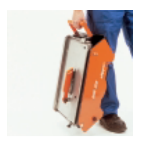
Maschine can be handled with full tank.