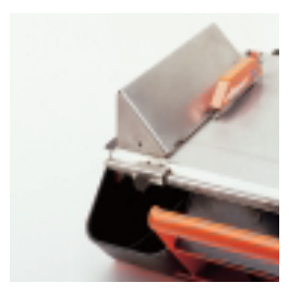
Integrates 45° bevel support.