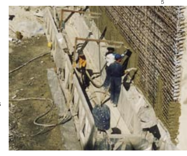
... for major special-purpose installations such as this renovation job on a concrete motor-way bridge in Italy.

This means the quantity of material to be delivered always corresponds exactly to requirements and provides thus optimal conditions for application.