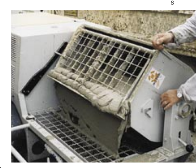
The swing mixer for the SP 11 DMB is comfortable to operate and makes light work of difficult jobs.