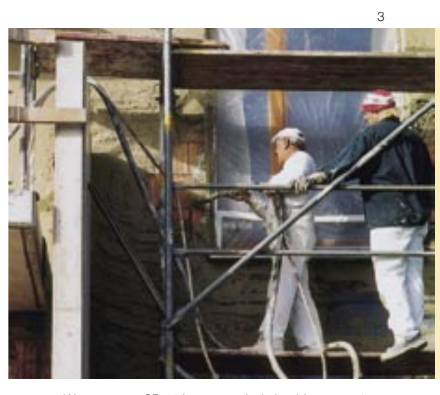
Worm pumps SP 11 have a particularly wide range of applications. They can work all types of job-site mixes, bagged plaster for inside and outside application and much more besides.

placed without problems through the pumps worm and stator. Just use the relevant type depending on the application, to guarantee the benefits of the worm pump's maximum performance, and minimum wear.