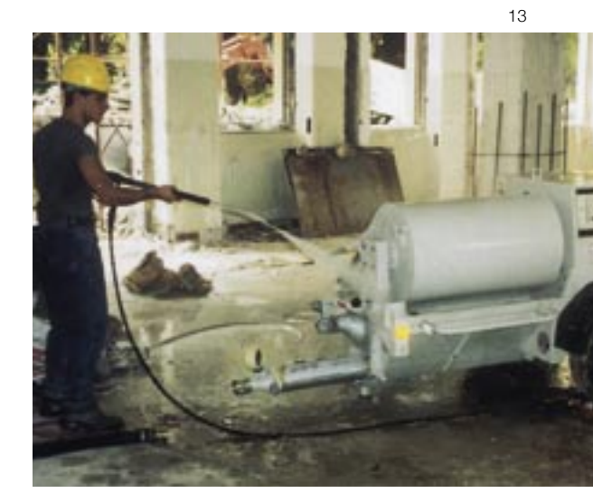
Pressure-clean your SP 11 using the built-in high-pressure cleaner and 140 bar water when the job has been completed (swivel discharge series).

The installed diesel engines (Kubota) for example in the heavyduty series have proven their long service life and reliability in many construction machines literally thousands of times.