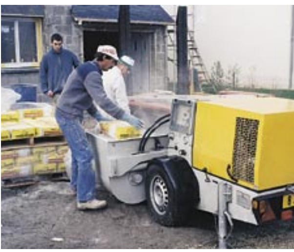
But that is by no means all! This SP 11 DMR has a lift mixer with powerful hydraulics to carry out the job.