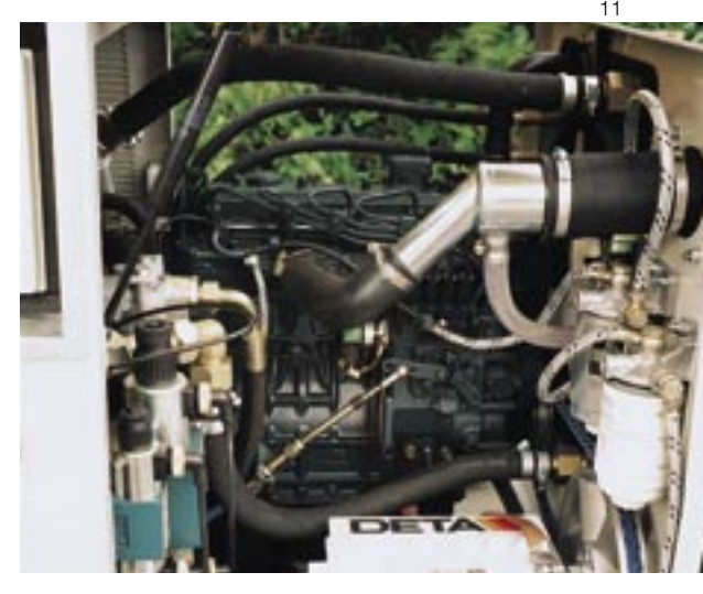
A modern diesel engine with attached hydraulics provides sufficient power to your SP 11 at every r.p.m.

One of the practical details: The water connections for the highpressure cleaner are mounted on the outside of the machine so during the cleaning operations, the hood can remain closed and the inside remains clean and dry.