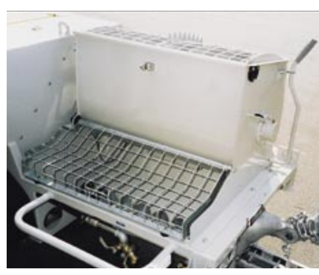
Simply choose the best one for your job from the three mixer types. The robust and cost-favourable flap mixer for the SP 11 pm T

A high-performance water cooling system makes sure of correct operating temperature of the motor and the hydraulics under extreme job conditions.