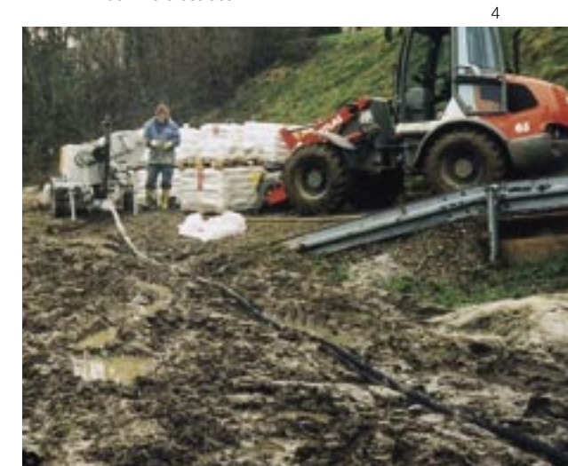
They are suitable for use on small to medium-sized standard jobs as well as ...