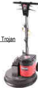
Heavy Duty Trojan