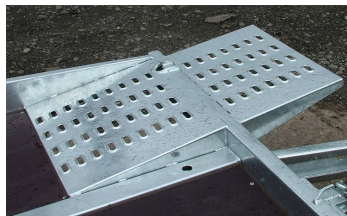
Front greddy ramps for extra loading space.