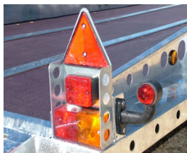
Fully enclosed rear light units and full European lighting regulations.