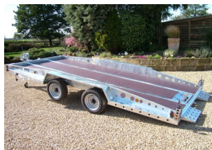
Fixed and hydraulic tilt bed options available on all models