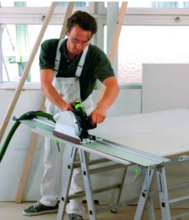
Using the TS 55 to saw MDF: clean, quick and tested for use on Australian building sites.