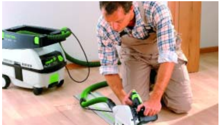
Using the TS 55 to saw timber floors: clean and quick.