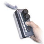
DSKE2 without extension arms