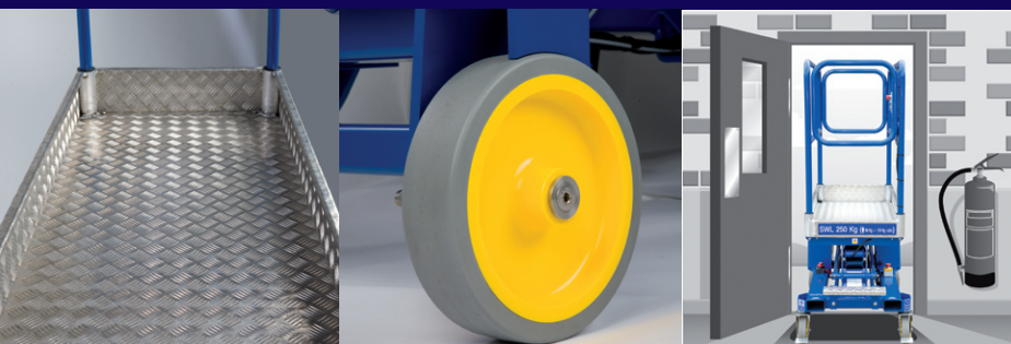
Non-slip, non-corrosion decking