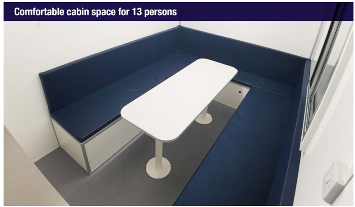
Comfortable cabin space for 13 persons